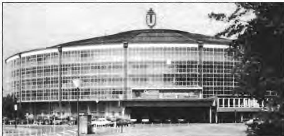
The Westfalen Halle, Dortmund, West Germany